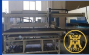
TRUMATIC500- Fully Automatic