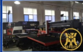
TRUMATIC500- Fully Automatic Japan AMADA - Fully Automatic