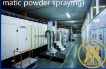
Reciprocating machine (automatic powder spraying)