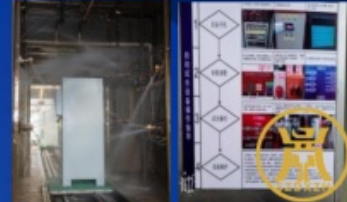
IPX6 Spray Water Testing System