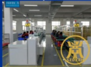
Small chassis wiring assembly line