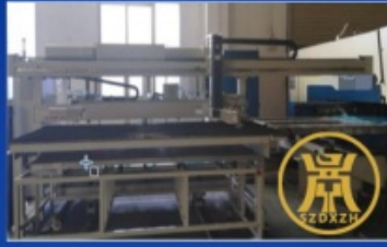
TRUMATIC500- Fully Automatic