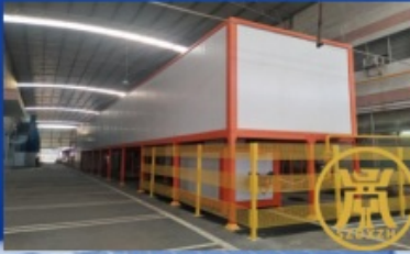
Automatic Line 3