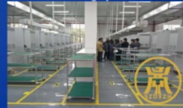
High voltage product assembly line