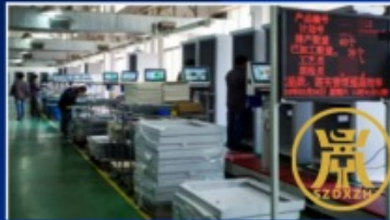
Large cabinet assembly line