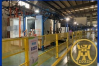
Automatic Line 2