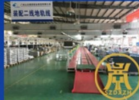
Small cabinet with assembly line