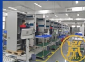
Outdoor cabinet product assembly line