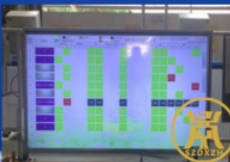
Surface treatment 2-wire (cabinet type):