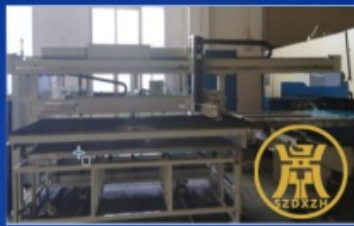
TRUMATIC500- Fully Automatic