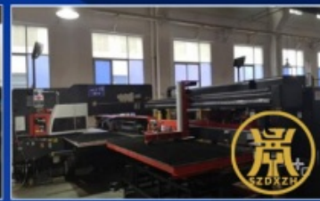
TRUMATIC500- Fully Automatic Japan AMADA - Fully Automatic