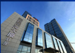
Shenzhen R&D Center