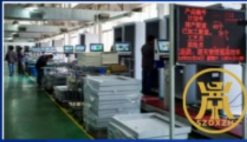
Large cabinet assembly line