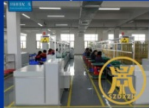
Small chassis wiring assembly line