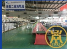
Small cabinet with assembly line