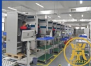
Outdoor cabinet product assembly line