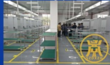
High voltage product assembly line