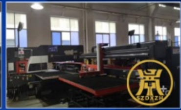
TRUMATIC500- Fully Automatic Japan AMADA - Fully Automatic