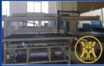
TRUMATIC500- Fully Automatic