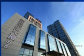
Shenzhen R&D Center