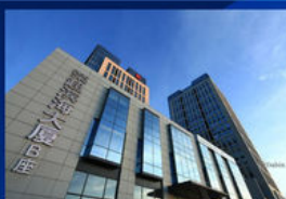
Shenzhen R&D Center