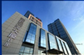
Shenzhen R&D Center