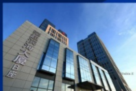
Shenzhen R&D Center